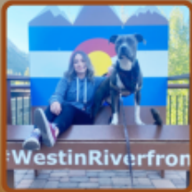
Fallon R. 10/05 Birthday